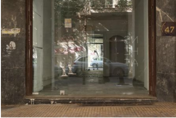
Snehta Mariya, Outside View and Display