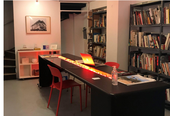
Snehta Satellite, Coworking space and Library