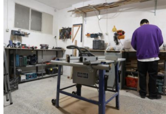
Snehta Main Space, Carpentry