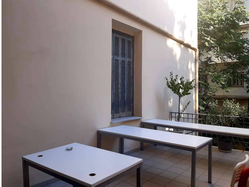
Communal spaces, Terrace - Garden, ANKAA Project and Saffron Kitchen Project